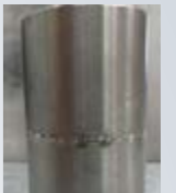
Pipe butt weld Ø 31.75 x 2 mm

The Q-SPOT (Quick Spot) function makes it possible to minimise tacking times for light gauge sheet metal. The operator conveniently places the tungsten electrode on the fixing point, thereby obtaining perfect control of the position of the join. Once the electrode has been lifted the machine emits a very high intensity welding current pulse with a very short preset time (from 0.01 Sec to 1 Sec). The pulse time varies depending on the type of sheet metal to be joined. In this way the welded point closes instantly with minimum heat transfer, leaving the metal white, clean and almost cold.