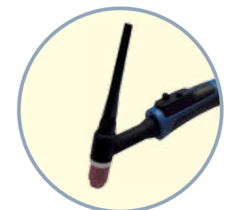
TORCH UP & DOWN