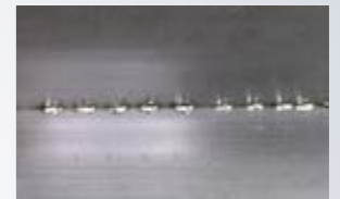
Corner spot welding thickness 0,6 mm